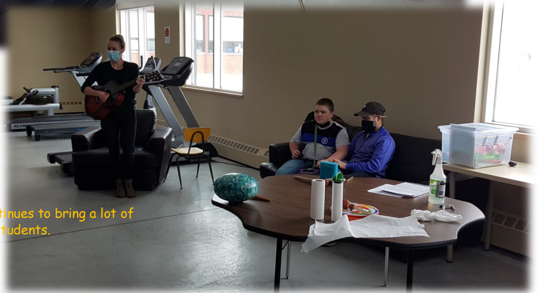
Music therapy continues to bring a lot of enjoyment to our students.