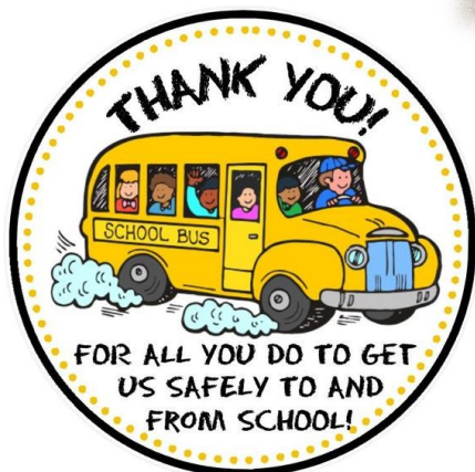
Thank you to our amazing bus drivers and bus e/a's for your support of our school and students! We can't wait to see you pulling up in front of our school, hopefully sooner than later!