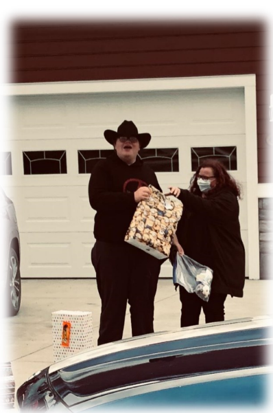
Staff were able to drive by and wish