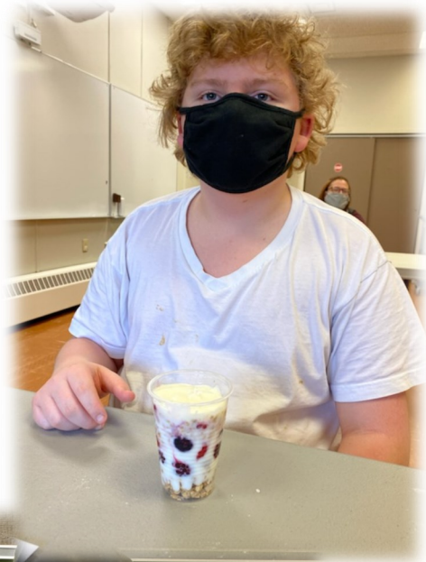
Healthy breakfast-great start to the day!