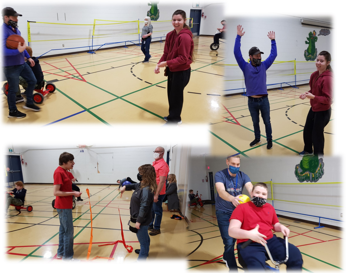
When the weather turns cold inside activities can be fun!