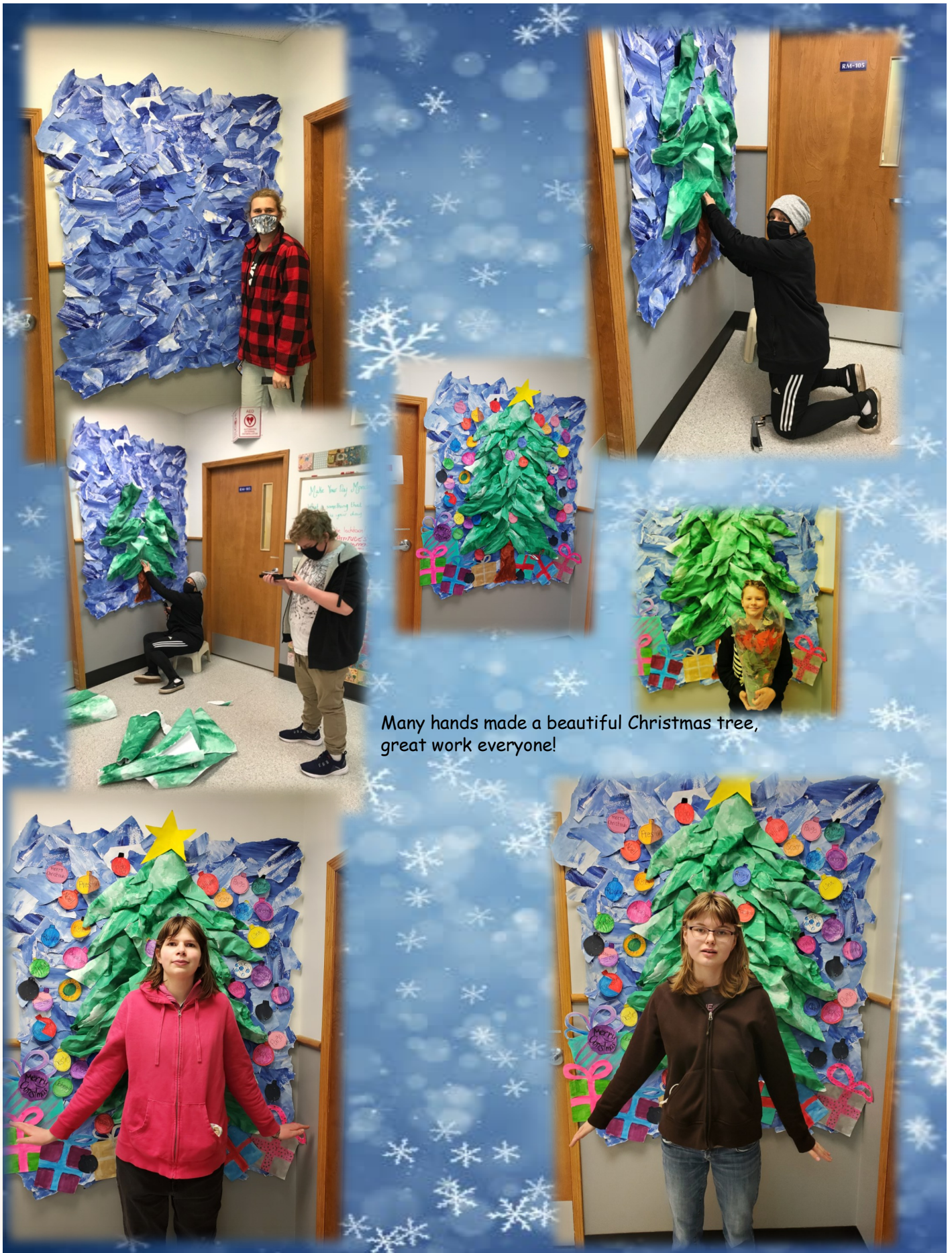
Many hands made a beautiful Christmas tree, great work everyone!