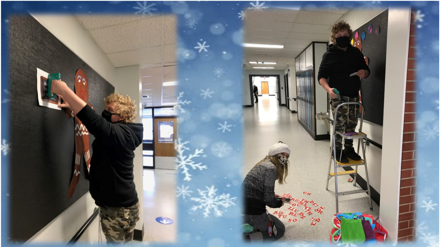
Horizon students and staff are keeping the Christmas spirit alive and well by posting their thoughts of gratitude and happy thoughts for Christmas this year!