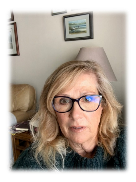
Hoping everyone is staying safe and looking forward to a better time in the not too distant future